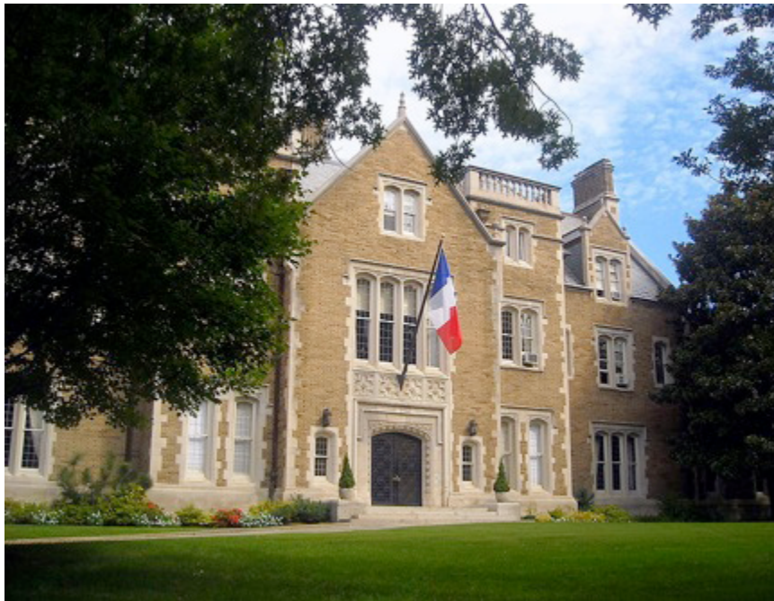
The Residence of the Ambassador of France to the United States in Washington, DC

Renaissance Française-USA, the American Delegation of La Renaissance Française, founded in Paris in 1916, aims to recognize persons who have raised awareness of the French language and Francophone cultures among people living in the United States. The American Delegation will act at all times in harmony with the policies of La Renaissance Française.