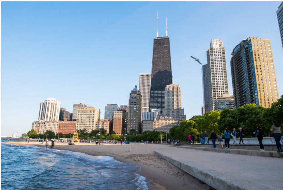
The Chicago Waterfront

La Renaissance Française – USA, the American Delegation of La Renaissance Française, founded in Paris in 1916, aims to recognize persons who have raised awareness of the French language and francophone cultures among people living in the United States. The American Delegation will act at all times in harmony with the policies of La Renaissance Française.